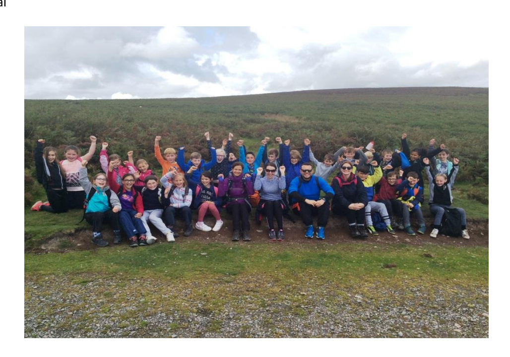
Year 5 Manor Adventure: reaching the summit of the Long Mynd!