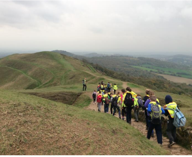
Year 5's trip to the Malvern Hills- a great time was had by all!